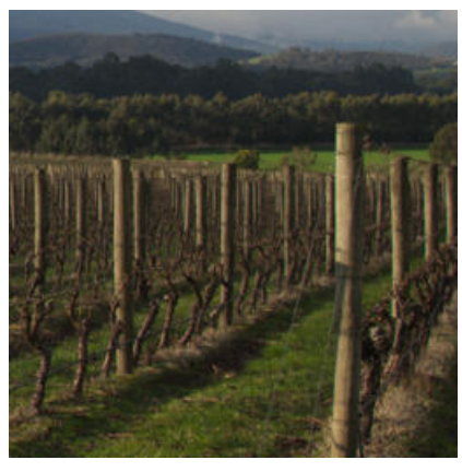
ALASKA database (number 51336).