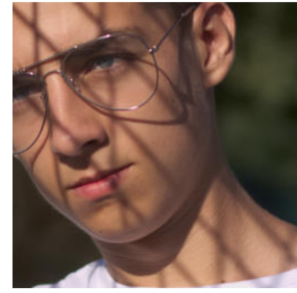
(a) A developed image from the (b) A developed image from the Wesaturate database (index ZYlVRQY-DWE).