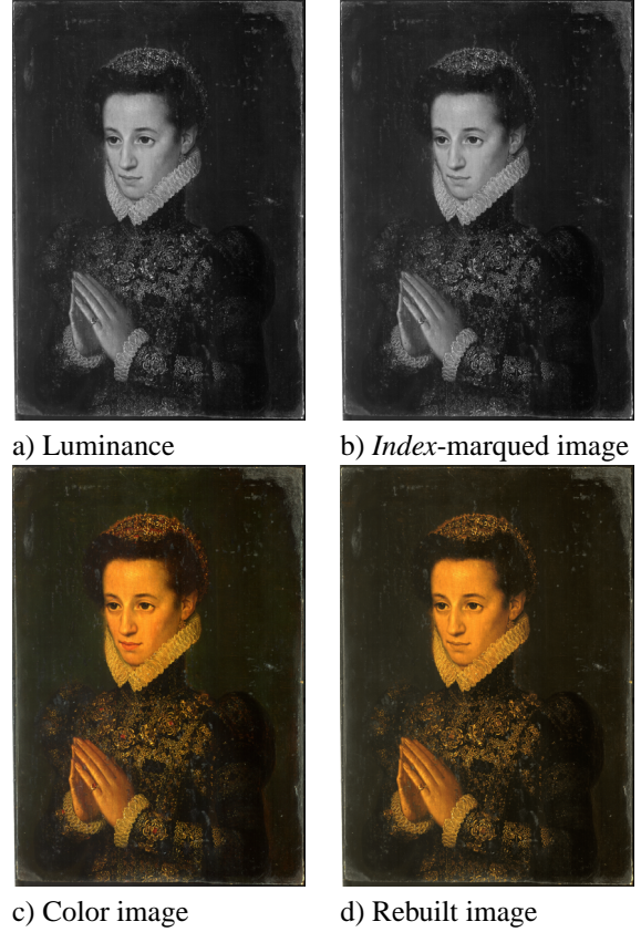
Fig. 1. Grey-level image hiding its color palette and the rebuilt color image.

Figure 2. This decomposition would have been impossible in a current desktop computer if proceeded on the full data. Indeed, the memory complexity necessary for the minimization of Equation 3 on the complete image is around 186 GB 4 . With a sub-sampling of 9604 pixels (around 10000 times less pixels) the memory complexity is falling to only 19 MB which is little 5 .