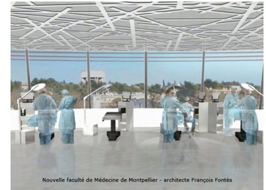
Nouvelle faculté de Médecine de Montpellier - architecte François Fontès

September 6-13, 2017 Montpellier (France)