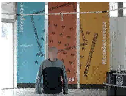
b_1 : frame 75