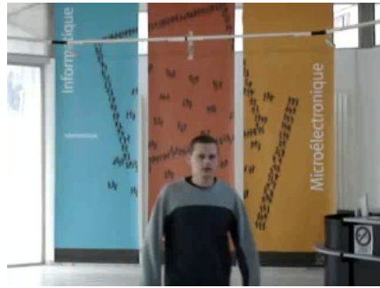
a_2 : frame 90