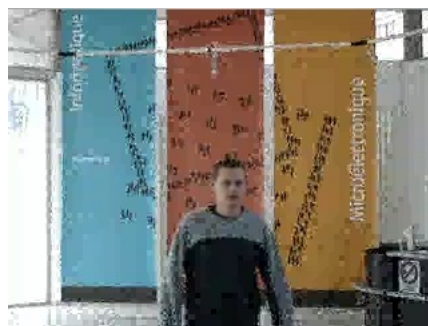
c_2 : frame 90