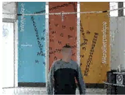
b_2 : frame 90