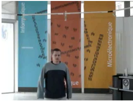
a_1 : frame 75