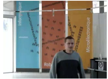
a_3 : frame 105