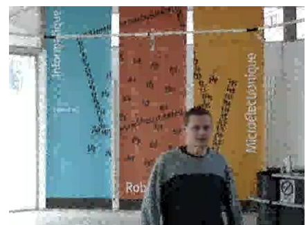
c_3 : frame 105