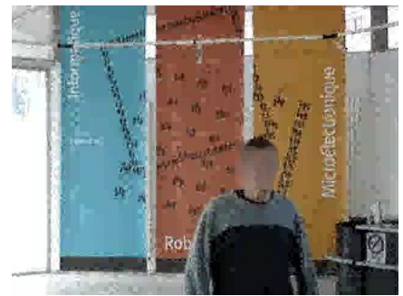
b_3 : frame 105