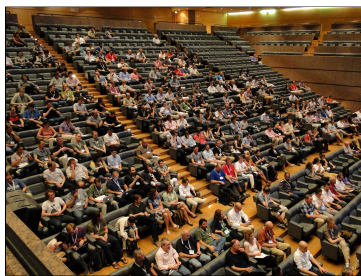
Many participants attended the opening session.