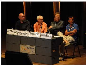
Program, Conference and Local chairs together on stage.