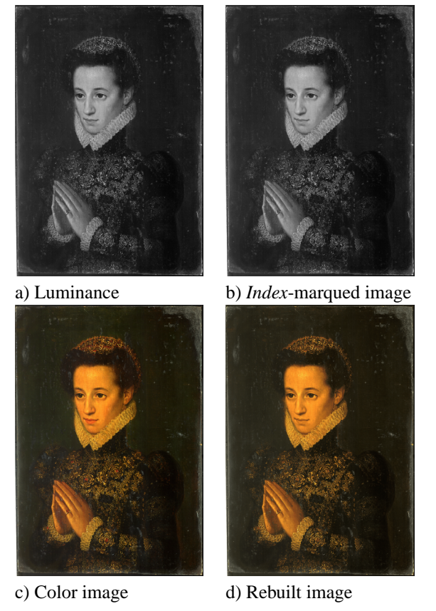
Fig. 1 . Grey-level image hiding its color palette and the rebuilt color image.

Figure 2. This decomposition would have been impossible in a current desktop computer if proceeded on the full data. Indeed, the memory complexity necessary for the minimization of Equation 3 on the complete image is around 186 GB<sup>4</sup>. With a sub-sampling of 9604 pixels (around 10000 times less pixels) the memory complexity is falling to only 19 MB which is little<sup>5</sup>.